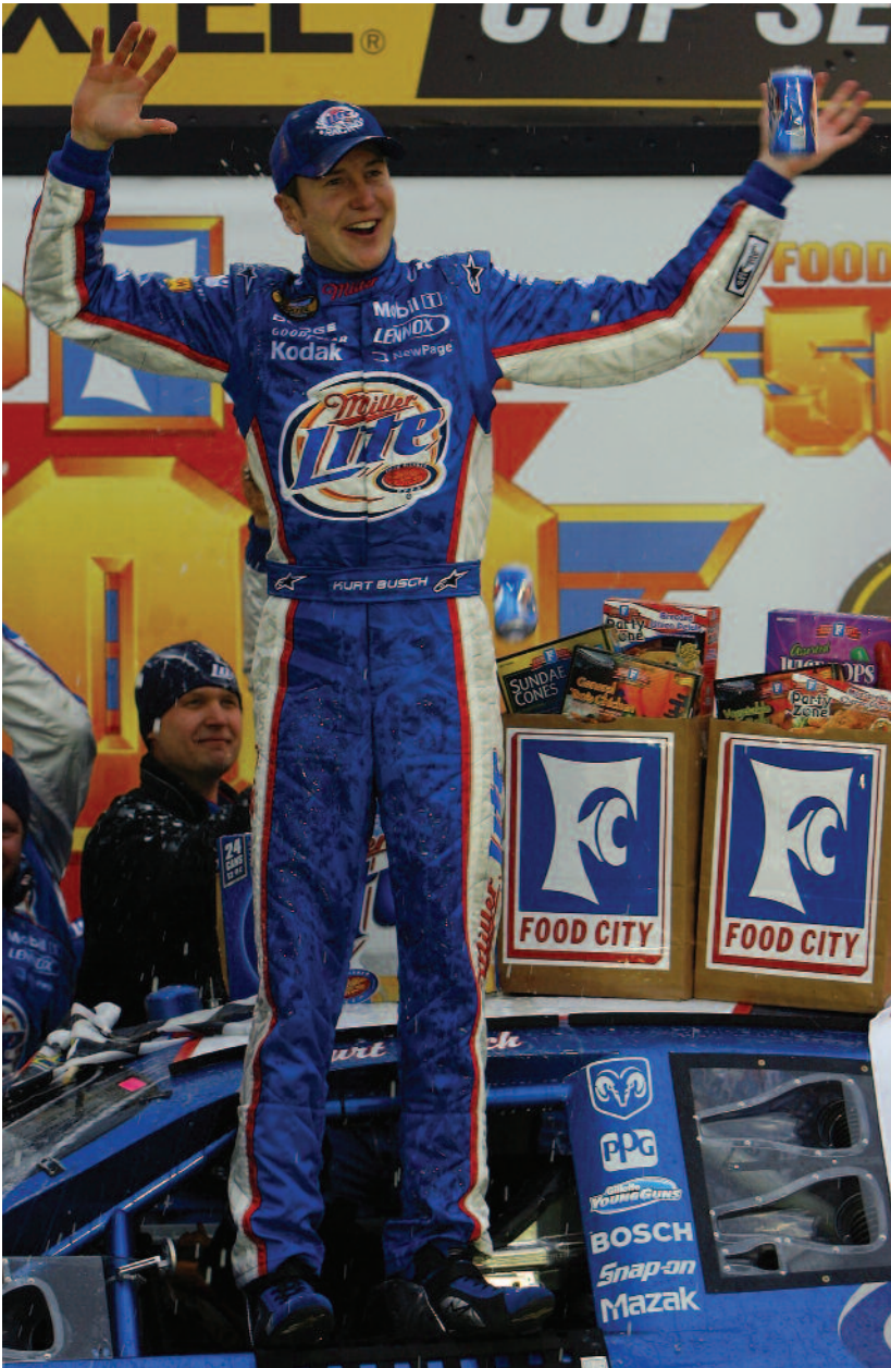
Kurt Busch celebrates his Bristol win in 2006.